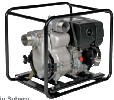
Robin Subaru EPT3-50RX